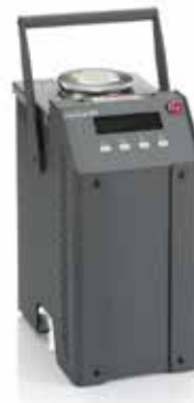
LiquiCal HM Calibration Bath

A fluid's ability to transfer heat between molecules is known as thermal conductivity. Fluids with a high heat transfer will heat or cool faster, whereas a low heat transfer will be slower at reaching the same goals. Having good thermal conductivity can significantly improve the uniformity of calibration baths.