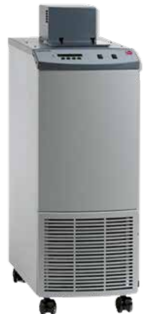
LiquiCal LL Calibration Bath