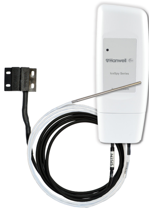
Product code: IN-THD02F2