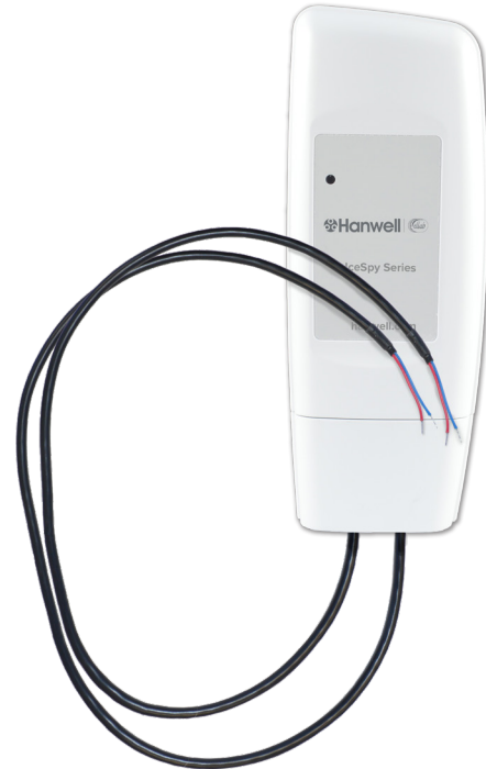
Product code: IN-VT003F2